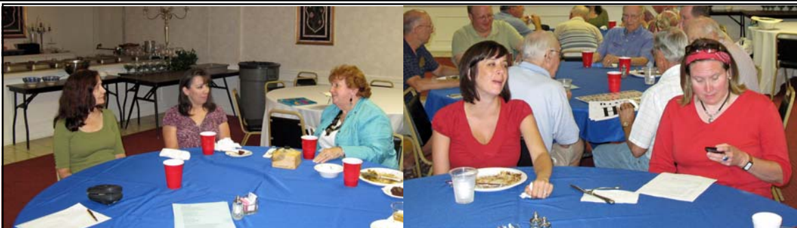
A couple of tables at the August 22 nd meeting.